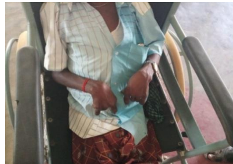
Persons with profound spasticity causing deformities

Mobility is very important; to make a child go to school, to enable a student travel to college, and to make a worker go to office. Orthoses, or in layman's terms calipers are appliances given to paralyzed or weak limbs fit to the children on a custom made basis, enabling them to walk erect.