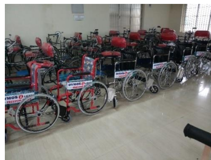
Mobility Aids and Appliances lined up for Distribution in one of our camps in Chidambaram.